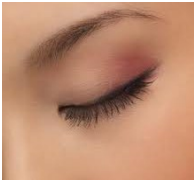
Brow Shape Enhances

Eyebrow shaping takes your appearance to a new level of beauty. A well-groomed brow line creates the subtle difference that will affect the overall look of your entire face.