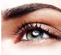
Get Your Eyes Noticed

A good place to start is with the natural shape of your eyebrows. Let the natural shape your eyebrow guide you should not try to change them completely. Thickness is also a consideration when determining the correct eyebrow shape. Ideally, the impact of your eyebrows should balance with the rest of your face and hair. If you have thick hair with larger facial features, your eyebrows should be thicker and more dramatic. If you have thin hair and petite features, your eyebrows should be more subtle.